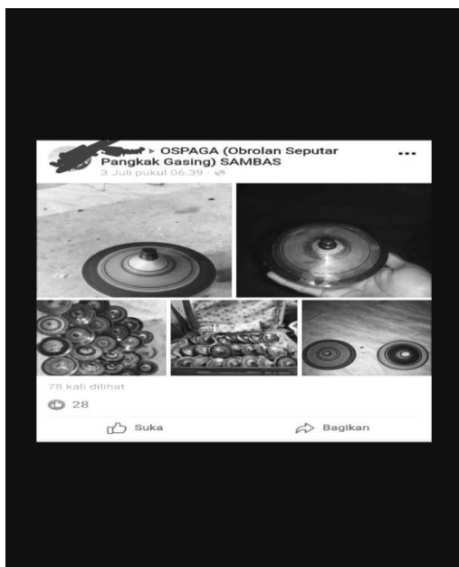
Picture.2 Some people invited openly in a Facebook group to play Pangkak Gasing

Based on search results on social media there are at least two accounts of pangkak gasing group in Sambas Regency named OSPAGA (chat about pangkak gasing) Sambas and Sambas Bepangkak . Members of the Facebook account group conduct activities such as inviting or looking for opponents, selling gasing, selling gasing ropes, and even sharing experiences related to pangkak gasing . In addition to adults, many Facebook accounts in both groups consist of children and teenagers and are expected to share about their activities playing pangkak gasing . New media in social interaction, especially in the field of pangkak gasing, make social media a tool for interaction where agents have never met and started meetings in the real world. The average member of a pangkak gasing group on Facebook is a digital native, a younger generation born when the internet has become a part of their lives.(Lucy Pujasari Supratman 2018:47).